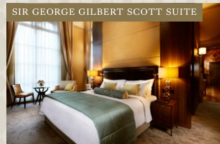
SIR GEORGE GILBERT SCOTT SUITE