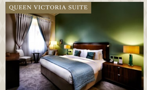
QUEEN VICTORIA SUITE