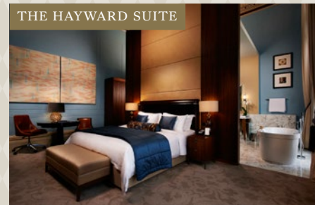
THE HAYWARD SUITE